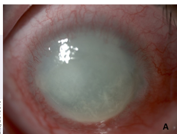
Parasitic (Acanthamoeba) infection